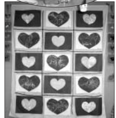
Friendship Quilt Display at DCP Annual Art Show