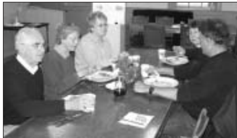
The Elocution Society considers preschool pancakes.