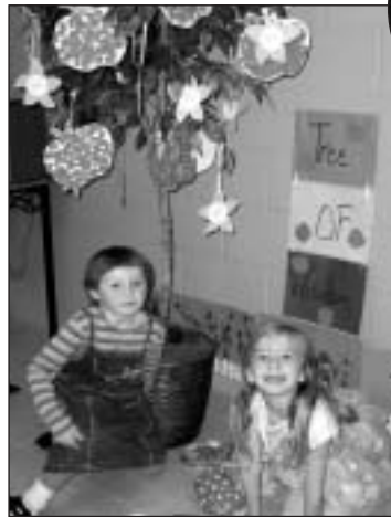
Snacking under the tree of wisdom at the DCP's Annual Art Show