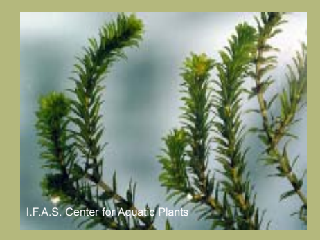
Hydrilla Hydrilla verticillata