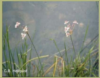
Flowering Rush Butomus umbellatus