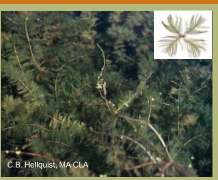
Eurasian Water-Milfoil Myriophyllum spicatum