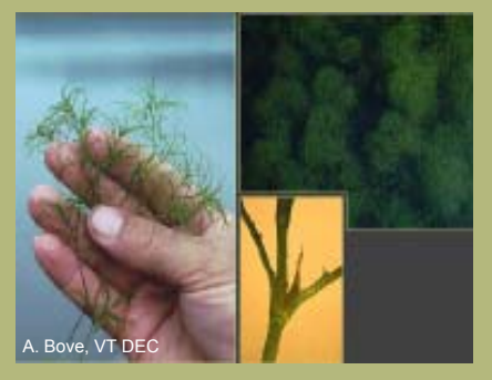
European Naiad Najas minor