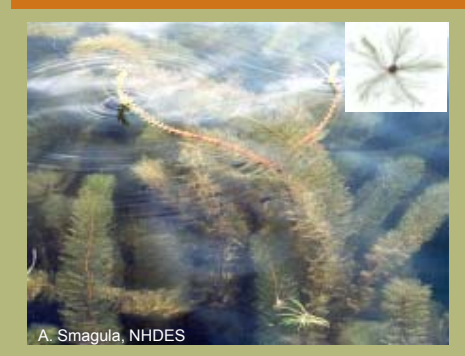
Variable Milfoil Myriophyllum heterophyllum