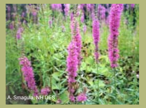
Purple Loosestrife Lythrum salicaria