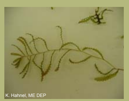
Curly-leaf Pondweed Potamogeton crispus