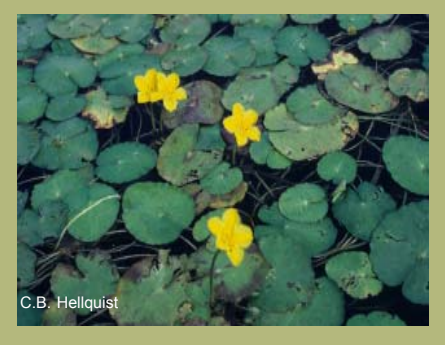
Yellow Floating Heart Nymphoides peltata