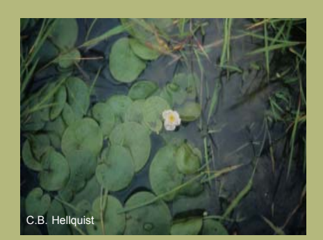
European Frogbit Hydrocharis morsus-ranae