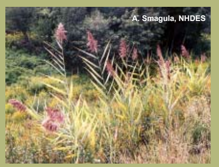
Common Reed Phragmites australis