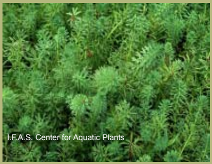
Parrot Feather Myriophyllum aquaticum