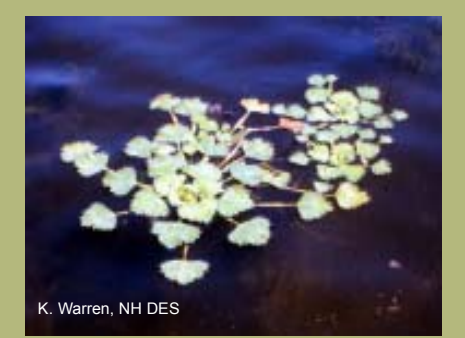
Water Chestnut Trapa natans